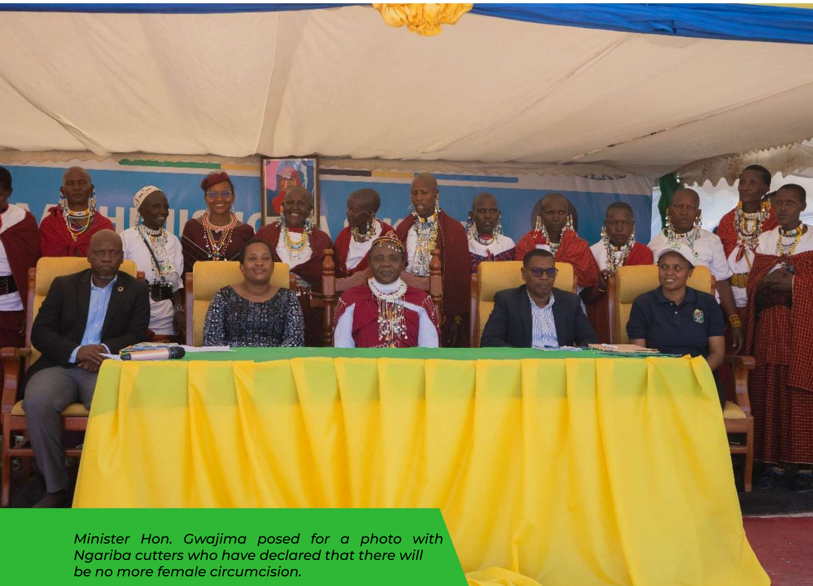
Minister Hon. Gwajima posed for a photo with Ngariba cutters who have declared that there will be no more female circumcision.

During the week of 6–12 February, Monduli District became the national center of the campaign against FGM. As part of its ongoing community engagement efforts, PWDT continued its routine field activities, meeting with different groups, raising awareness, and mobilizing community action.