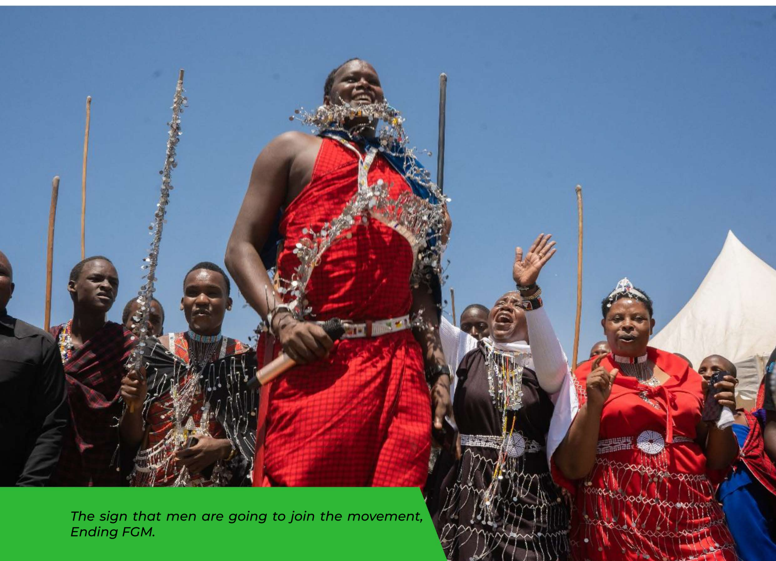
The sign that men are going to join the movement, Ending FGM.

During the event, the speeches highlighted the role of men and traditional leaders in protecting girls and changing harmful norms. Champions from Musoma, Manyara, and other regions participated to share their experiences, emphasizing the significant challenge that the region faces, where one in every three girls is still subjected to circumcision. The message was clear that we need new strategies and stronger collaboration.